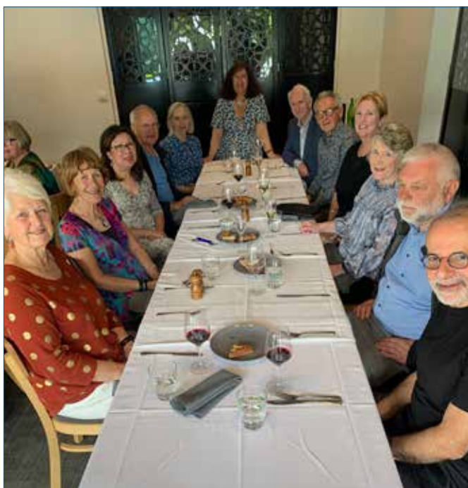
Intermediate Italian End of year luncheon

Courses such as movie visits, gallery visits, walking and cycling groups, photography, excursions are some of the ones that do include coffee breaks as part of the program. Many groups organise social activities at the end of the year.