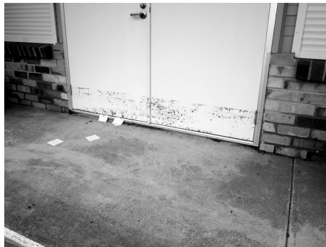
Water level—Main Hall doors

Classes at other venues will proceed according to times advertised in the Curriculum.