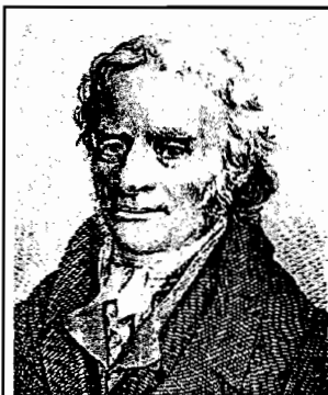
Tobias Mayer (1723 to 1762)